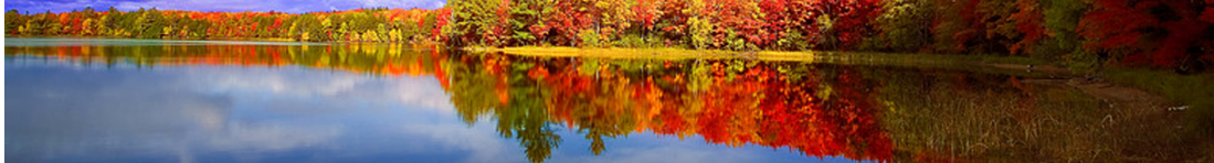
(Grand Teton's, Jackson Hole, Wyoming)